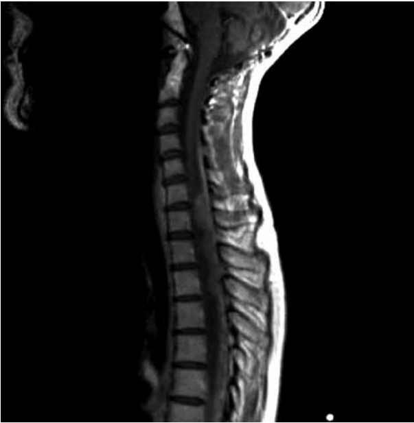
FIG. 1. — T1 weighted sagittal MRI before treatment, showing thoracic and cervical spread of the disease with tumour enhancement.