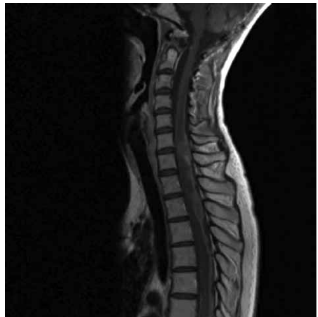
FIG. 3. — T1 weighted sagittal MRI 7 months after the treatment with temozolomide, still showing no progression.

The next MR-imaging of the cervical and the thoracic spine showed no progression of the tumour and less tumour enhancement (Fig. 2) The MR-imaging of the cerebrum showed a reduction of tumour enhancement. 7 months after initiation of therapy, there was still no progression of the