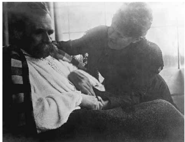
FIGS. 1 and 2. — Two rare pictures showing Friedrich Nietzsche in 1899 with the clinical signs of a left hemiparesis, with adduction of the left arm and a bedridden state.

Klassik Stiftung Weimar ; Hans Olde, may 1899.