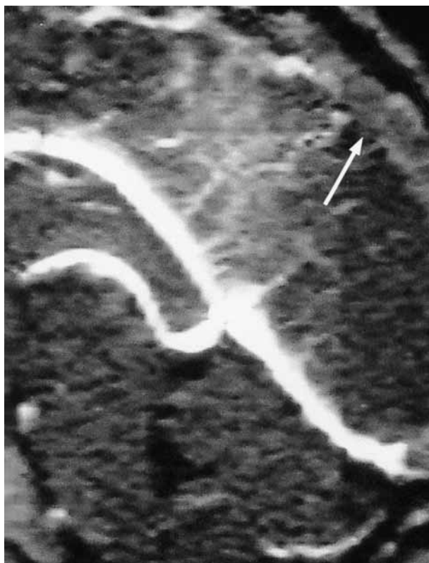
FIG. 2. — Sagittal reconstruction of the cerebral MR venography showing the occlusion of the superior sagittal sinus (arrow) contrasting with the patent deep venous system.

Screening for coagulopathies and auto-immune disorders showed normal antithrombin, normal protein C, normal protein S, normal activated protein C resistance, normal complement C3 and C4, normal homocystein, and absence of lupus anticoagulant, anticardiolipin antibodies and antinuclear antibodies.