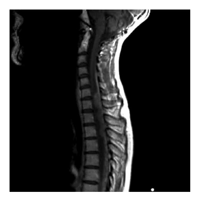
FIG. 1. — T1 weighted saggital MRI before treatment, showing thoracic and cervical spread of the disease with tumour enhancement.

evidence of tumour localisation elsewhere. The patient underwent a suboccipital craniotomia and the tumour was macroscopically completely removed and appeared to be a medulloblastoma by pathological examination. She received post-operative craniospinal irradiation with a dose of 35 Gy followed by a boost at the posterior fossa of 20 Gy.