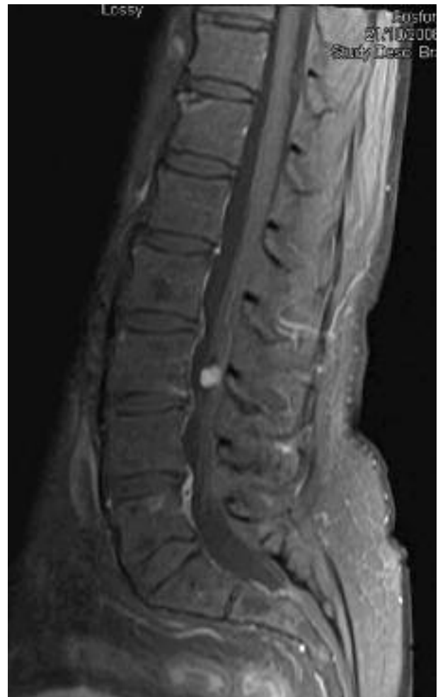
FIG. 1a. — T1 weighted gadolinium-enhanced sagittal MRI of the lumbar spine showing avid homogeneous enhancement of the lesion. This should raise the suspicion of a possible vascular tumor.

It was felt that the lesion should be surgically removed, largely because of its uncertain significance. A laminectomy was performed from L2-4 and a classical 'cherry-red' lesion was found adherent to the filum terminale (Fig. 1b). A feeding artery and vein were seen entering the tumor along the filum terminale from above. The tumor was removed 'en bloc' by dividing the filum above and below. The tumor measured 1.4 × 1.3 × 1.1 cm and demonstrated the typical microscopic pattern of numerous