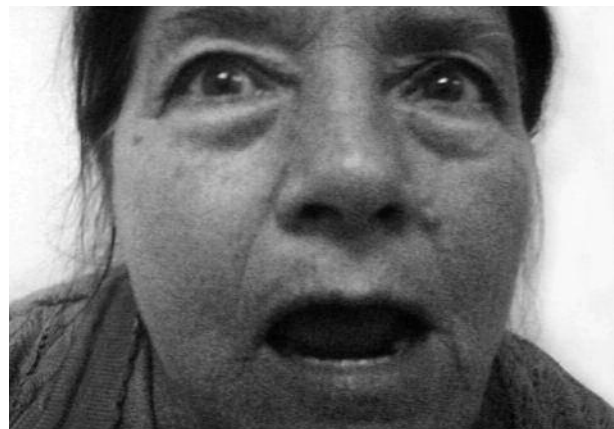
FIG. 1. — Adduction of the left eye with jaw opening

A sixty-year-old woman was admitted to our clinic because of the double vision that began abruptly twenty days earlier. She reported that double vision was induced by eating or chewing. The patient's past medical history was remarkable for arterial hypertension. She denied any ocular disease or abnormalities. Family history was noncontributory.