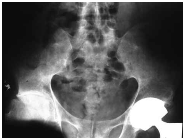
FIG. 1. — Pelvic x-ray showing bilateral grade 4 sacroileitis and hip involvement on right side and total hip arthroplasty in the effect side.